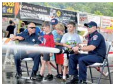
Renton River Days

On August 18, from 5 to 9 p.m., Cruz the Loop is back for a second year.